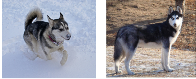
Figure 1: Two distinct classes from the 1000 classes of the ILSVRC 2014 classification challenge. Domain knowledge is required to distinguish between these classes.

The most straightforward way of improving the performance of deep neural networks is by increasing their size. This includes both increasing the depth – the number of net-